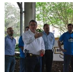
Leaders Against Litter