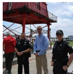
National Day of Prayer